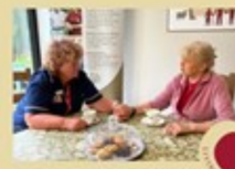
Serious Illness Support