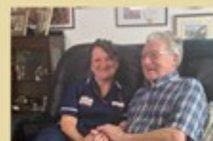
Hospice Care at Home